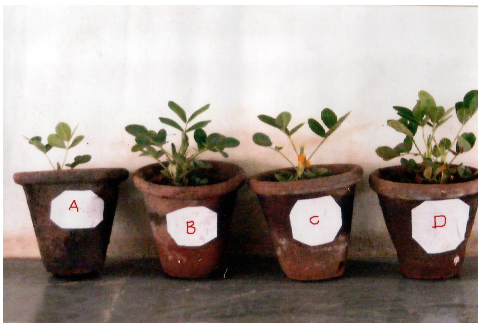
Figure 1: Plant growth promoting activity. Pot culture essay Phosphate Solublizing Bacterial Strain: A. Control, B. PSB1, C. PSB2, D. PSB3.

Therefore the mean of sample I, II and III are not equal.